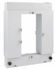
Current transformers DM4TA3000